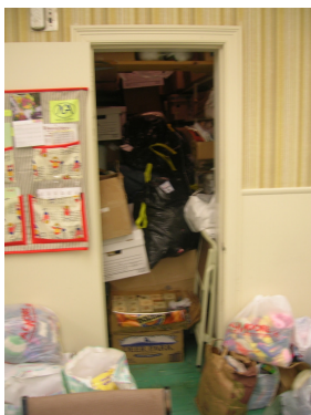
This is just a peek at the branch closet after a few things have been moved out. The space is great!

We in NGA give many kids a chance to go to school and fit in with the others. We help lessen torment and ridicule, provide a ray of hope, and give kids a chance to focus on education and be able to smile in their class picture. We change their lives. That's important stuff!