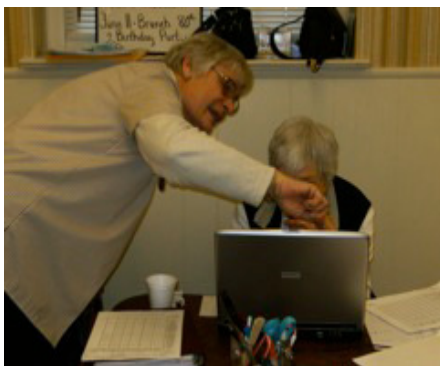
Branch labels, records, distribution allocation, rebates and mailings lists are computerized by volunteers.